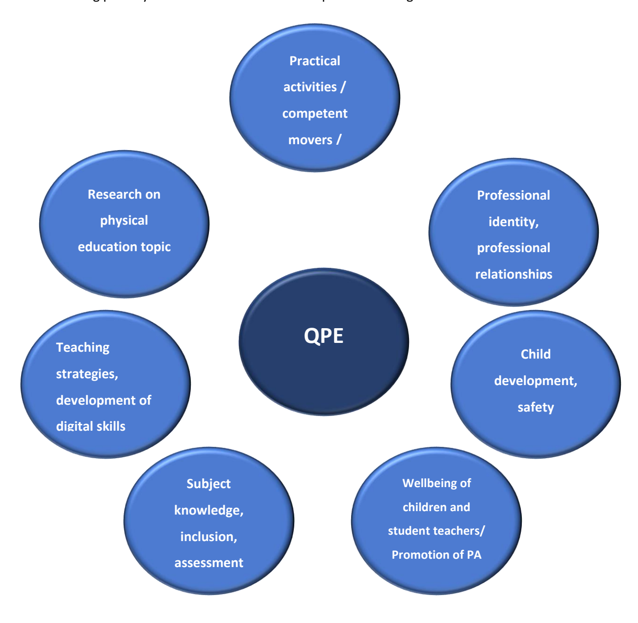
Figure 3 Themes

The organisation of the elements of study programmes into themes provides a means of highlighting key aspects for teaching primary PE. These core themes are represented in figure 3.